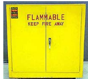
Properly labeled storage cabinet

This standard permits both metal and wooden storage cabinets. Storage cabinets shall be designed and constructed to limit the internal temperature to not more than 325°F when subjected to a standardized 10-minute fire test. All joints and seams shall remain tight and the door shall remain securely closed during the fire test. Storage cabinets shall be conspicuously labeled, "Flammable - Keep Fire Away."